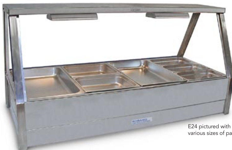
E24 pictured with various sizes of pans